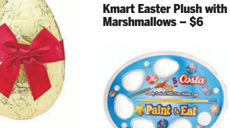
Paint & Eat Eggs $8 from The Warehouse.